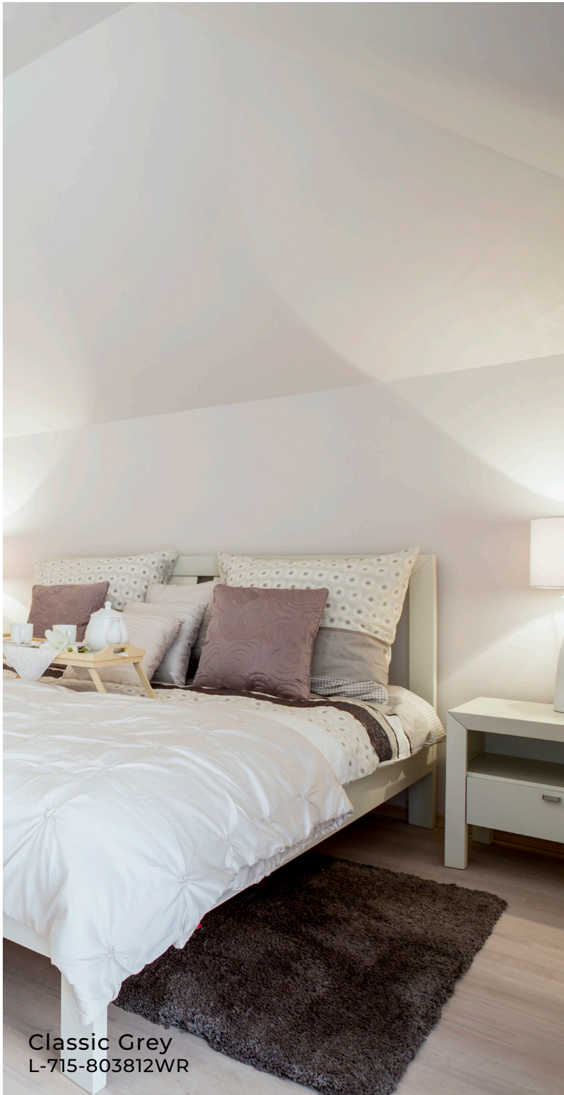
Classic Grey L-715-803812WR