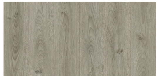
Classic Grey L-715-803812WR