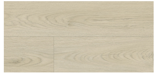
Himalaya Oak L-715-80381