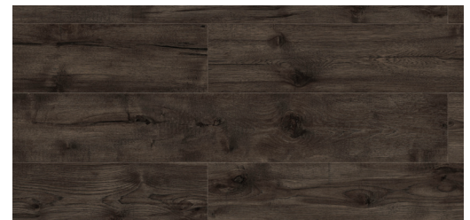
Diavolo Oak L-715-113-2