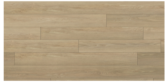
White Oak SPC-716-88065-001