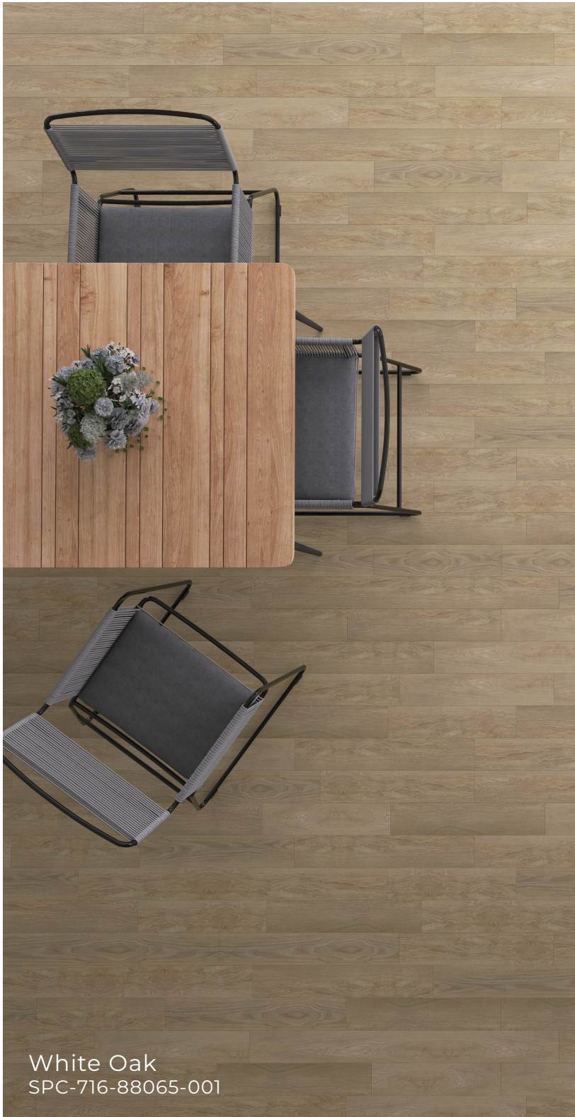
White Oak SPC-716-88065-001