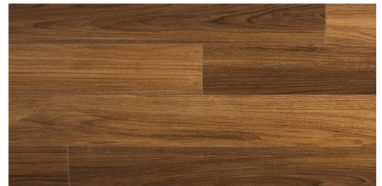
American Walnut SPC-716-CD311-05